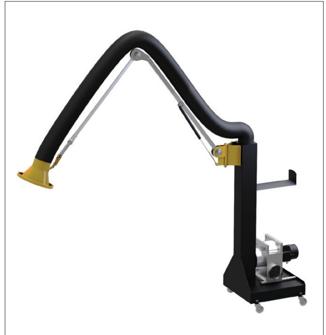
Mobile extractor with ASA arm

Do not start the Geovent Mobile extractor without the discharge hose mounted, as it can cause engine overload.