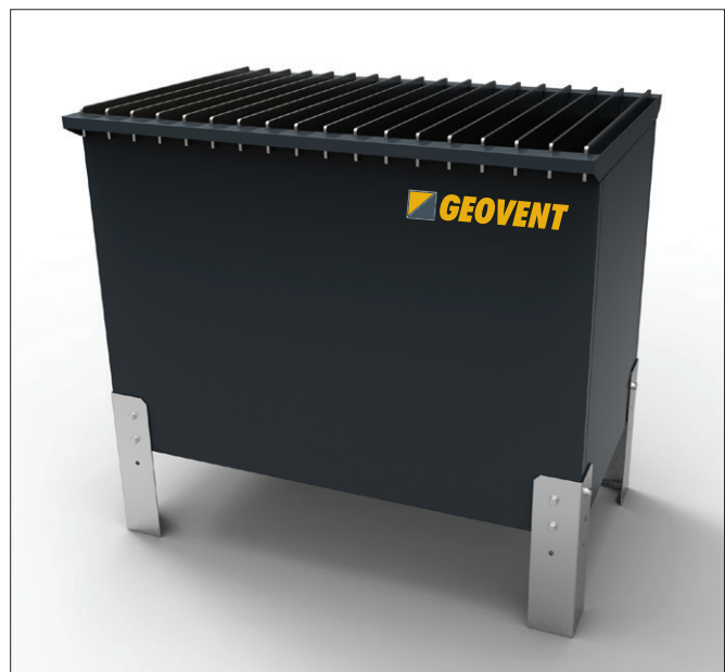
02-002 Welding table.