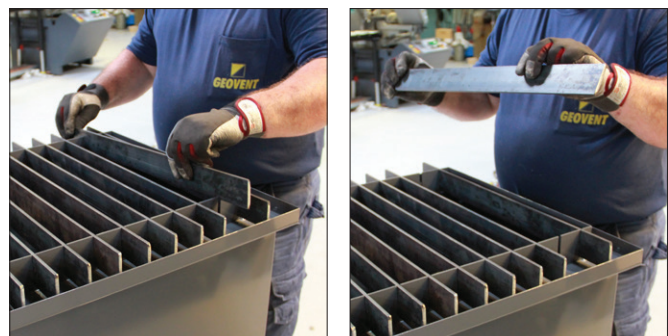
The rods can easily be moved / changed if needed.