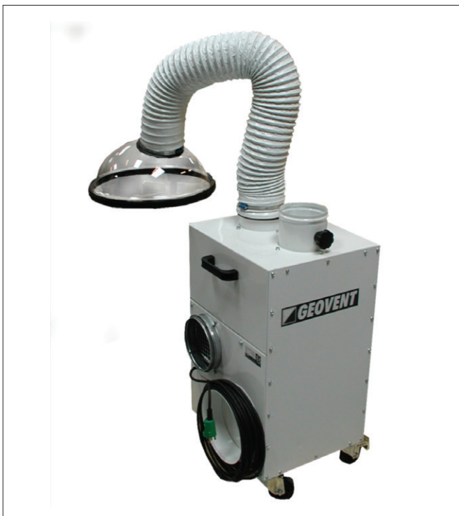
MVF-125-1 - seen from the back