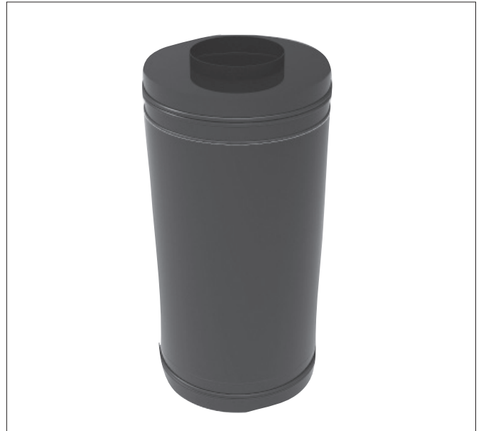
GeoFilter GF 315

The filter is assembled so that it can be easily disassembled, which makes gives easy access for service of the product.