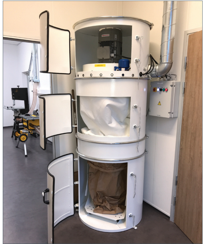
Fan, filter and waste bag