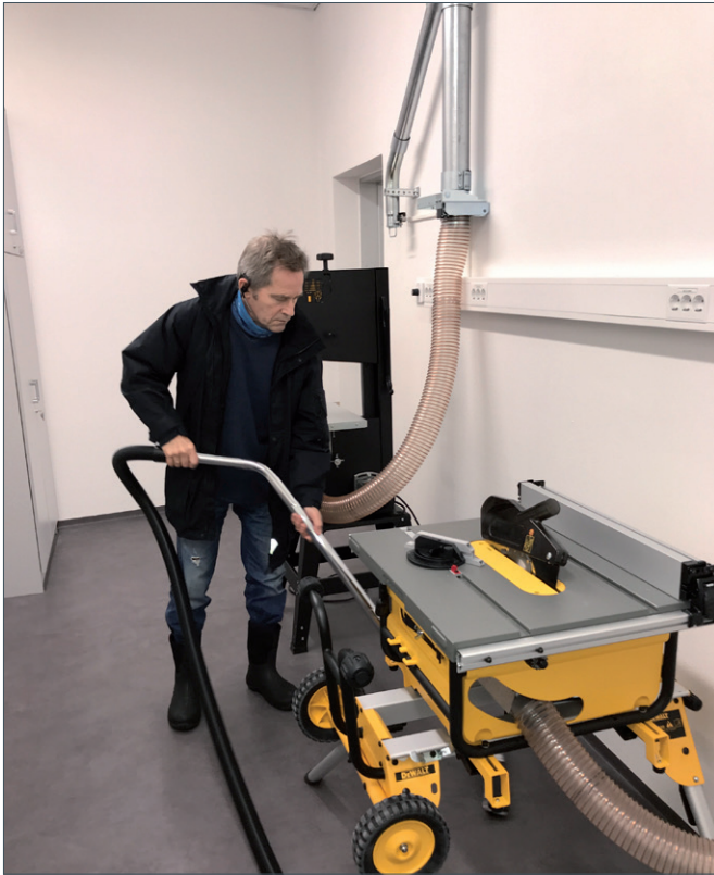
Vacuuming in a workshop