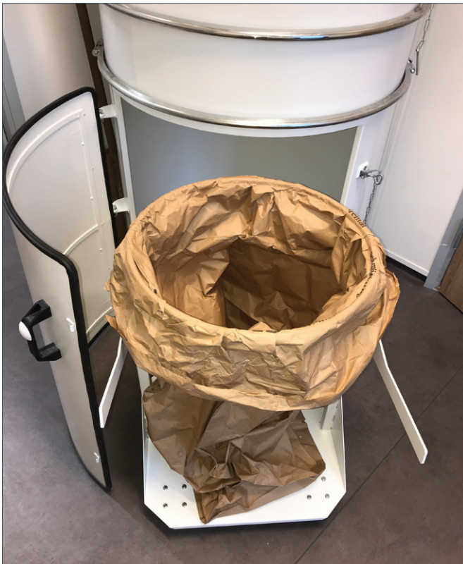
Emptying the waste bag