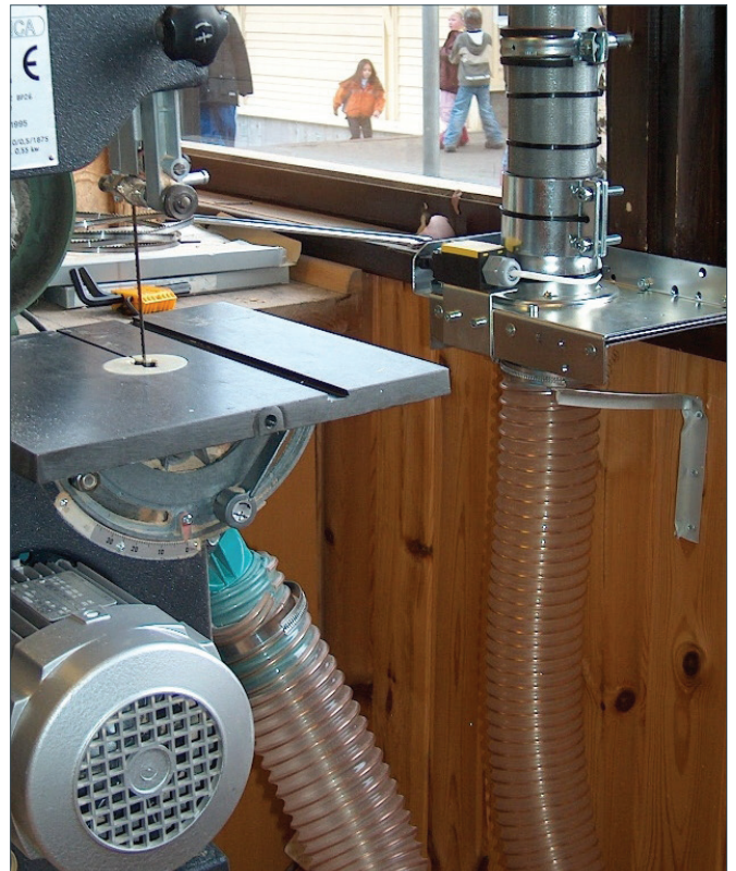
Extraction directly at the machine