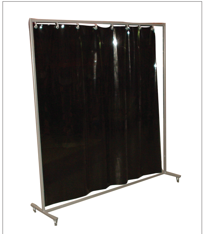
Welding curtain frame